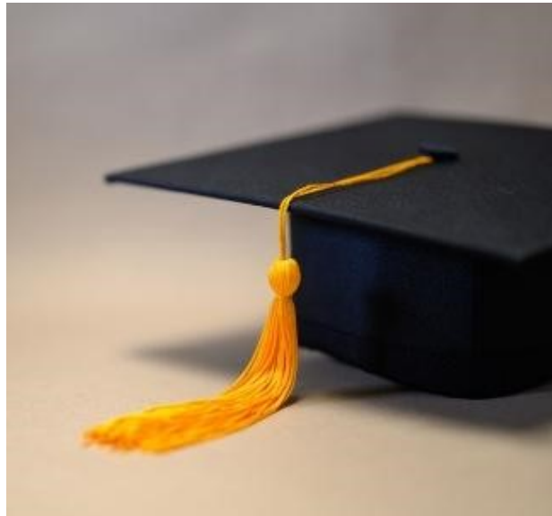
PVHS Interfaith Baccalaureate Ceremony